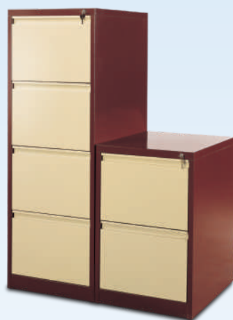
Beige and Russet

2 and 4 drawer units in Prince Grey and in two tone (Beige and Russet) colours.