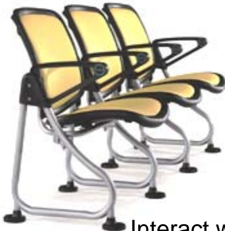
Interact without Desklet