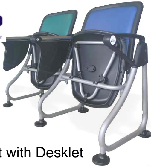
Interact with Desklet