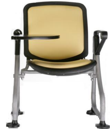
Interact with Desklet