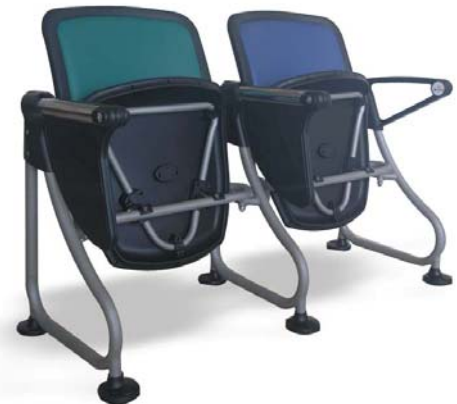
Interact with Desklet