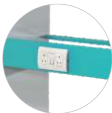
Highly integrated electricals are mounted on a panel-type re-agent shelf