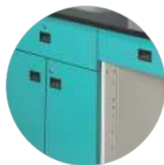
Shutters and drawers are flush with the cabinet

When it comes to lab furniture that seamlessly integrates your space with your requirements, as well as complements your other existing furniture, nothing can beat the Unique range from Godrej Interio. Constructed in a knock-down style and sporting a minimal carbon footprint, its over closing shutters make for much better aesthetics to make your lab look and feel smarter. Unique is made from Prime Quality CRCA Steel coated with epoxy paint which imparts a high scratch resistance and a special encapsulated powder is added onto the coating, which ensures that no oil or chemical marks are formed on the surface. Cabinet drawers employ high precision double extension ball slides, and the shutters are fitted with high quality, corrosion resistant, self-closing hinges. The design is also available with a skirting option.