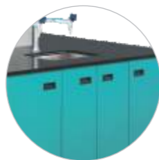
Special under-sink storage helps optimize space