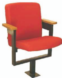
Audi - III