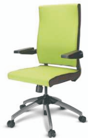
Kubix - HB, MB, Visitor