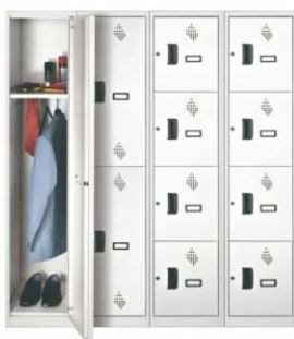
Personal Locker Unit