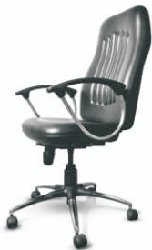
Regent - HB, MB, Visitor