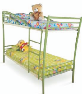
Deuce Bunk Bed