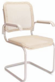
Breeze - 6