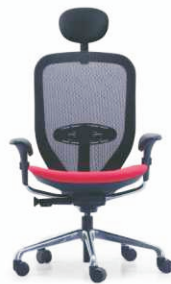
Ace - HB, FB, Visitor