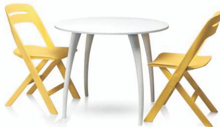
Novite with Rosa Table