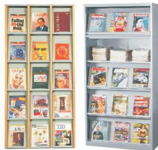
Periodical Display Rack