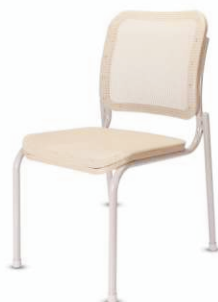
Breeze - 18