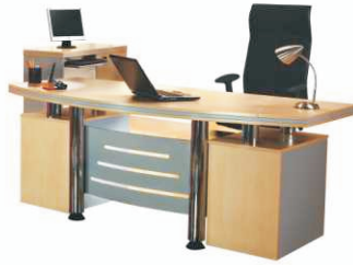
Marquis & Monarch