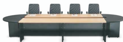
Senate with Spyder