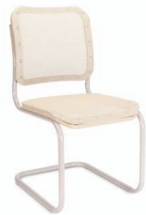
Breeze - 4