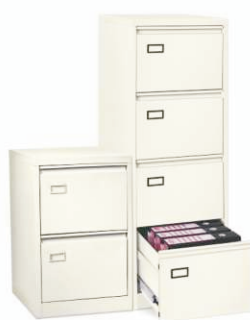
Vertical Filing Cabinets