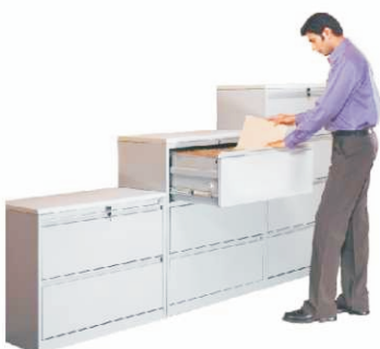
Lateral Filing Cabinets