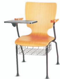
Staq with Desklet