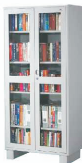
Glass door Storwel