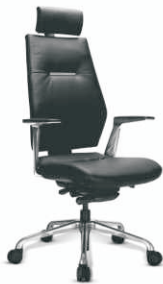
Sedna - HB, MB, Visitor