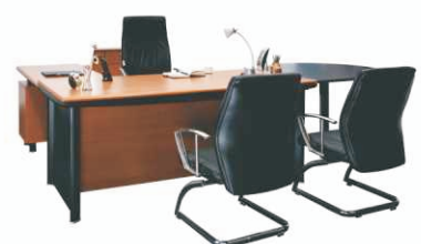
Maestro & Supremo