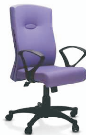
Bravo - HB, MB, Visitor