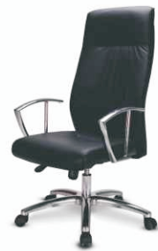
Supremo - HB, MB, Visitor