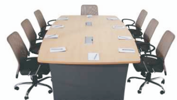
Ideate with Spyder