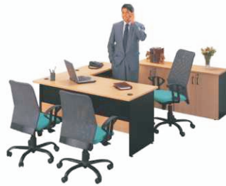
Mayfair & Spyder