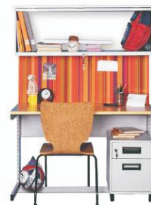
Champ & Staq Chair