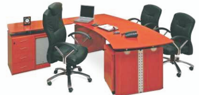
Icon & Halo