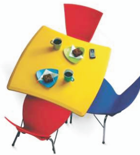
Café Pod with MPC - 4