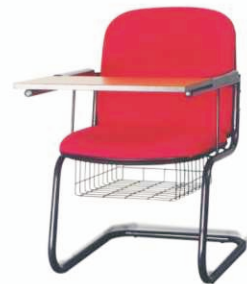
7004 With Desklet