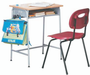
Winner & MPC 102