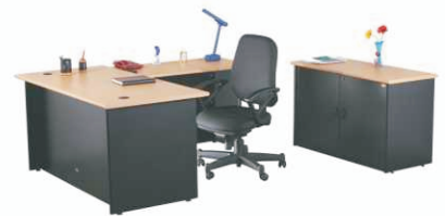
Finesse & Ultima