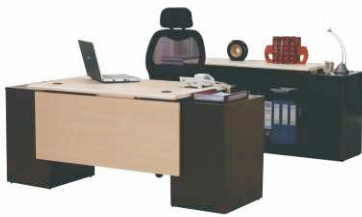
Trident Senior & Leoma