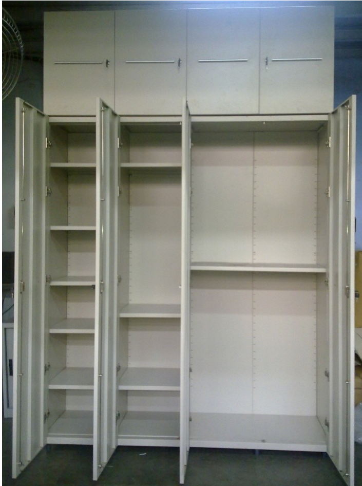
450 mm Wide Main, Add-on and a 900 mm Wide Unit