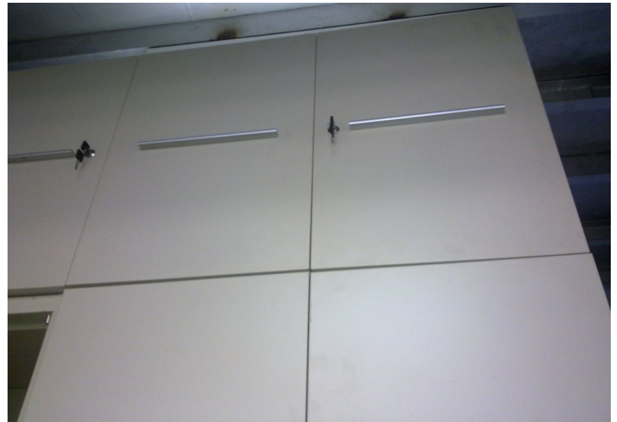
Over-Head Storage Unit with Lock