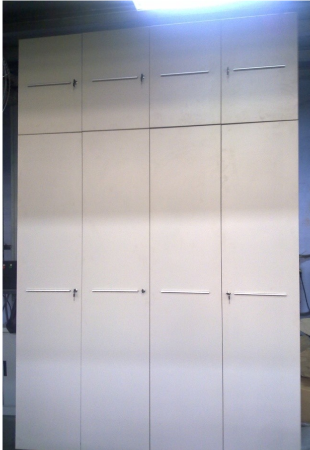
Full height GAIN with OHSU.