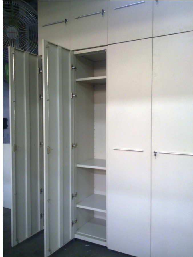
Adjustable shelves to suit different needs