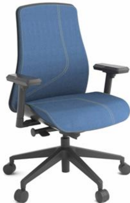
nrg Full Back