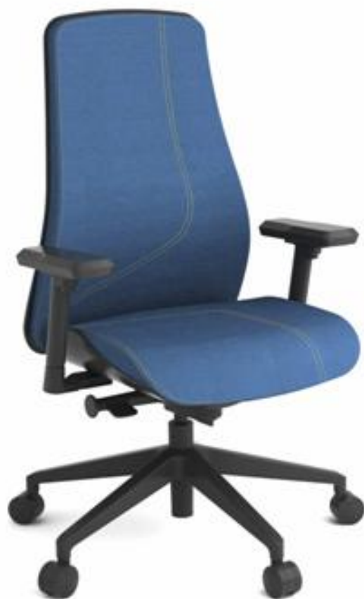
nrg High Back