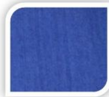
D02 Blue Denim