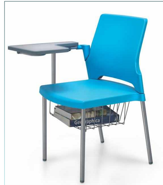
Unwind- with Desklet & storage