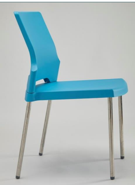
Unwind- café chair