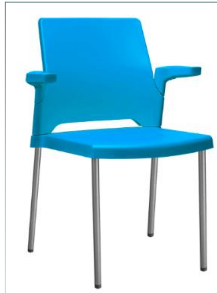
Unwind- with Arms