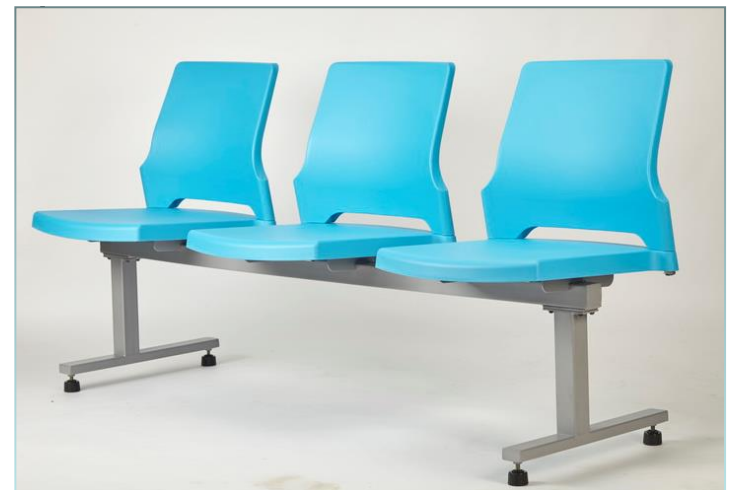
Unwind- 3 seater on beam