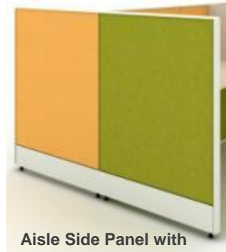
Aisle Side Panel with Offset

Additionally the extension frames also remains as the part of the new offering.