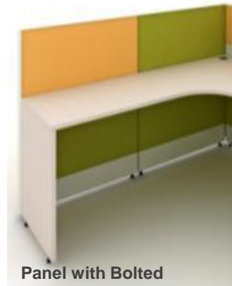
Panel with Bolted Frames