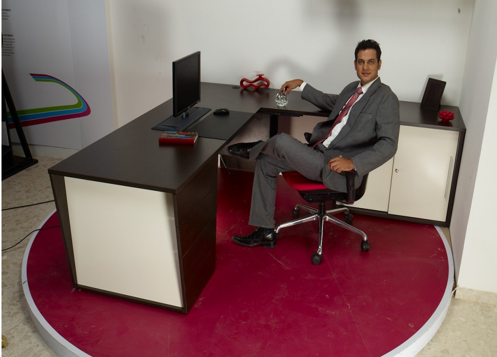
ERU with Sliding Door Unit as a Gable End