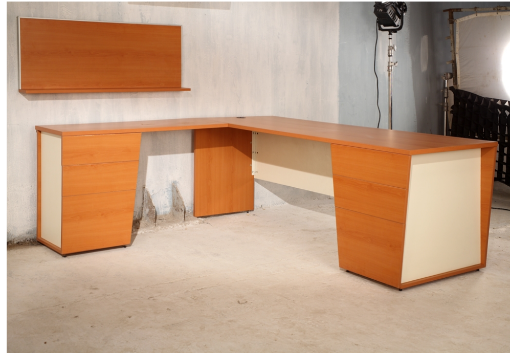
ERU with Pedestal as a Gable End

Please note that the Table and ERU are available in LHS & RHS Configurations