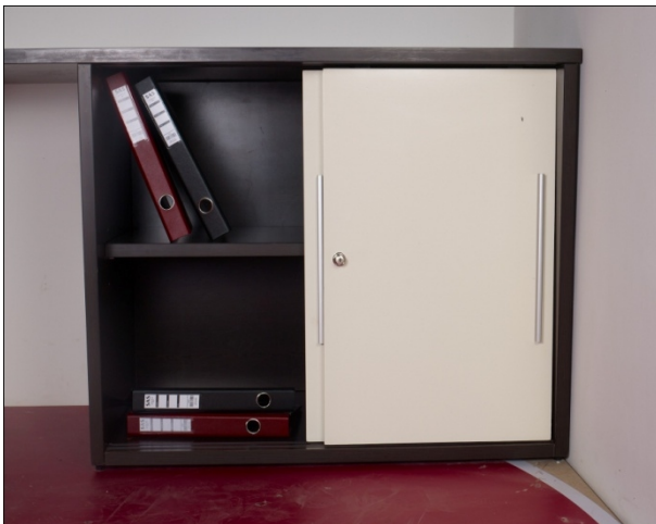
Sliding Door Unit