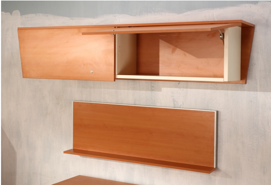
Overhead Storage Unit and Magnetic Tack Board