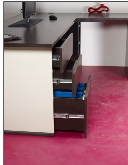
Pedestal with 3 drawers - Box, Box and File