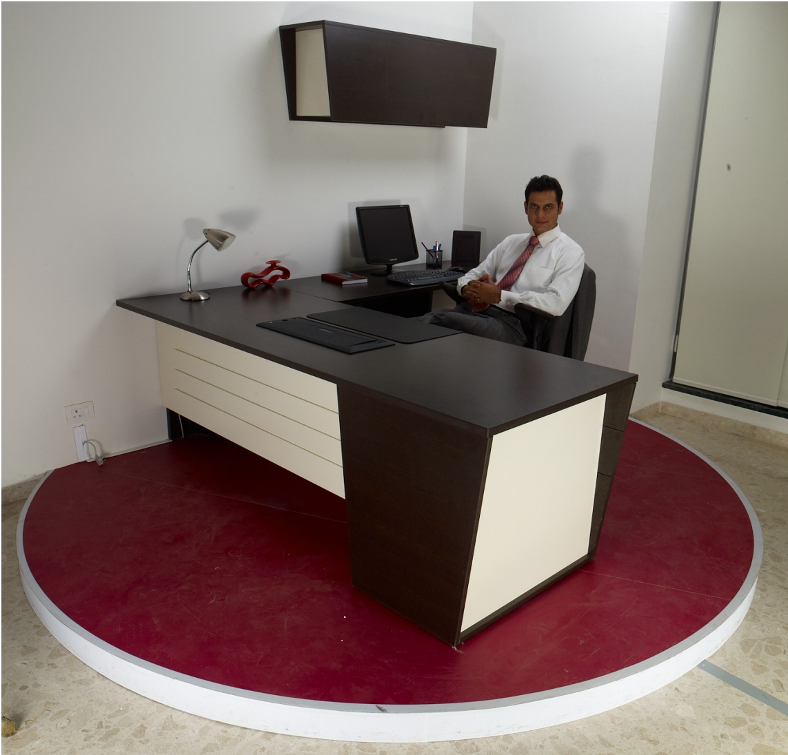
Main Desk with ERU and Overhead Storage Unit