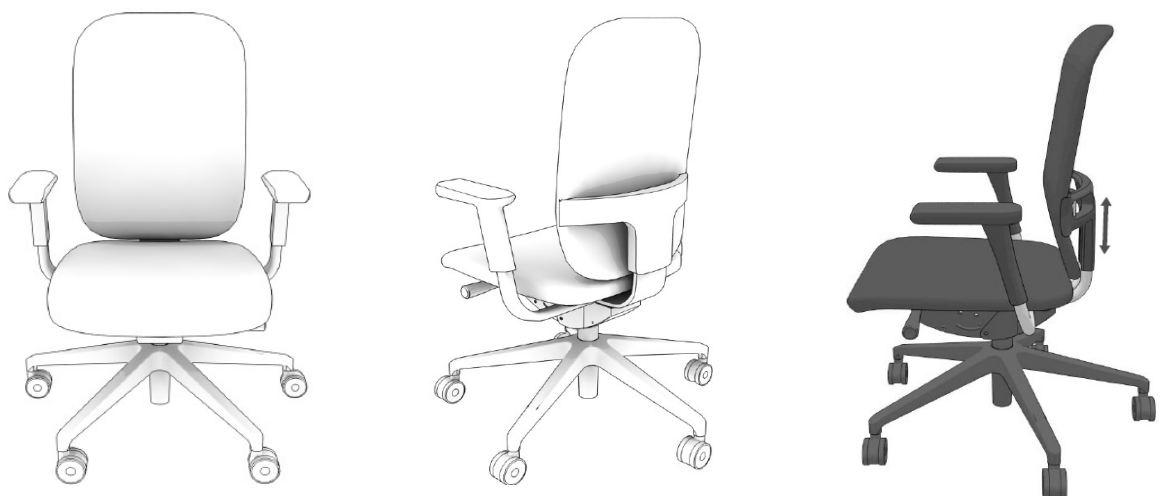
INITIAL CONCEPT OF VERSA

The most significant element of the chair is its 'T' shaped spine inspired from a 'wishbone' structure supporting the contoured chair back. This form also resembles a bird gliding across the sky with its wings opened wide. The wings branch out by spanning across the back from end to end representing strength through flowing lines. The T-spine becomes even more significant in the context of this chair, as it provides flexibility in back height adjustment. The form language of the chair is captured through its simplistic lines with rounded edges and highlighted by the prominent spine structure.