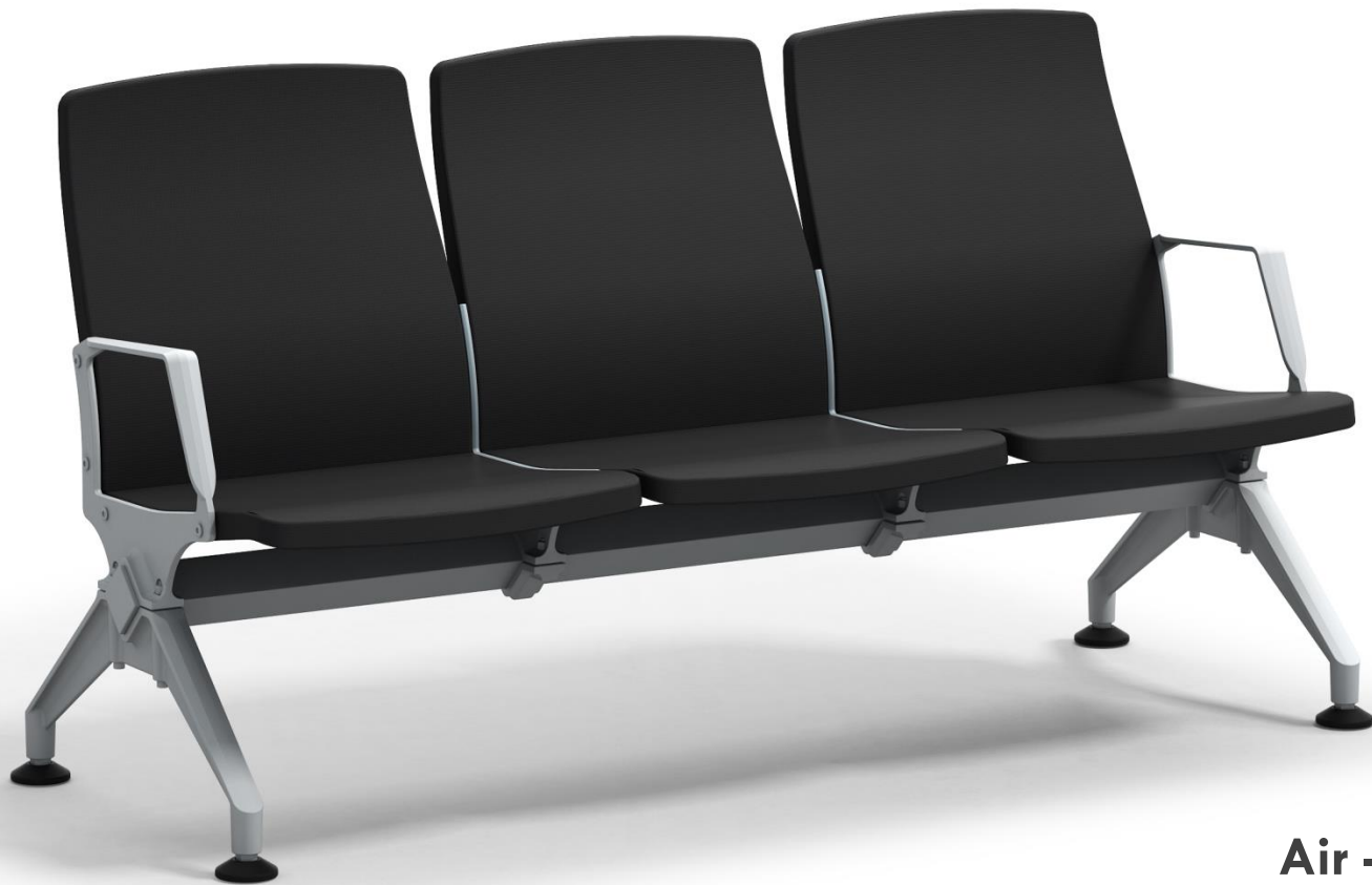
Air -3 seater with 2 arms