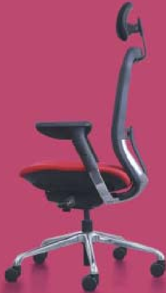
FULL-BACK WITH NECK REST